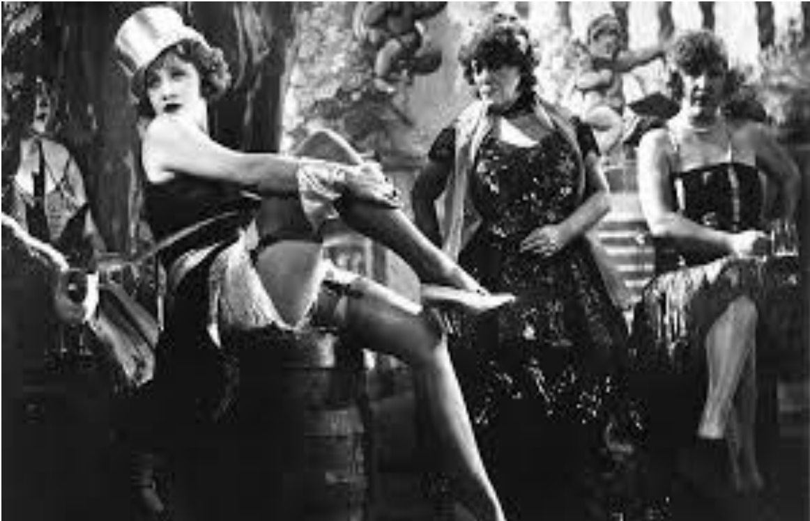
Scene from The Blue Angel

Germany's Weimar Republic (1919-1933) rose out of the ashes of World War I to become both the most creative and fraught periods of the twentieth century. Berlin as its exciting capital, was the place of the most radical experimentation in the visual and performing arts, in mass entertainment and theater, in literature and architecture. Berlin was viewed as a laboratory of modernity that drew people to its venues from all over the world. While the cultural stage was vibrant and intoxicating, the shell shock of World War I, the demands of the Versailles Treaty, economic instability, social upheaval and political turmoil also haunted the celebrated roaring twenties. In order to gain insight into the rich landscape of the Weimar Republic, we will explore avant-garde movements like Expressionism and Dada, Fritz Lang's monumental classic film Metropolis , and Bertolt Brecht's reinvention of theater and his play Man is Man . We will discuss the challenges Germany's fledgling democracy faced and the reasons for its failure, and consider the vast social changes, the impact of mass culture and technological developments on twentieth-century sensibilities, the changing cityscape and the emergence of the modern